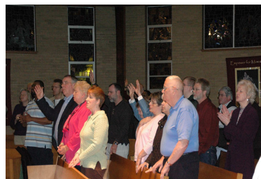
A Time for Praise and Worship