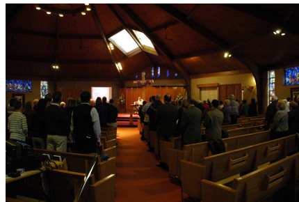
Living Hope Church

Living Hope Church of the Nazarene (Danvers Location) was the site of the 2008 Gathering of the Saints . Prayer was lifted, praises and testimonies were raised, and the Word was shared.