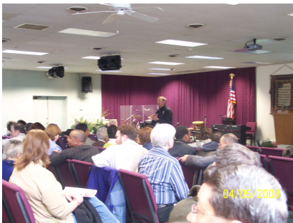
We were challenged...

We were reminded of the great commission...to “go and make the people of all nations my disciples”...to baptize them in the name of the Father and of the Son and of the Holy Spirit”...to “teach them to obey all the commands I have given you. And there is not a day