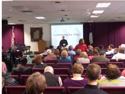
It was a great day of sharing...

when I will not be with you to the end of time.” (Mathew 28:19-20, Wm. Barclay translation)