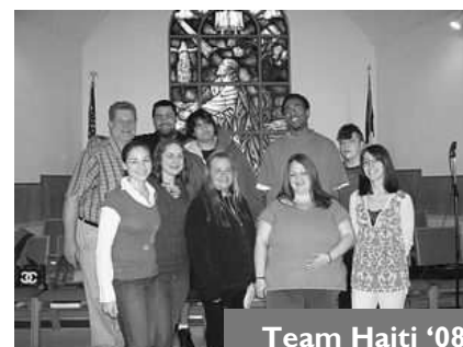
Team Haiti '08