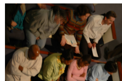
Photos from The Gathering of the Saints , 3-10-2007